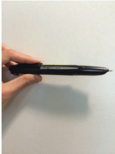
The digital pen