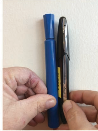
The digital pen in comparison with a highlighter