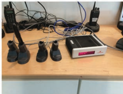
The digital pen's docking station