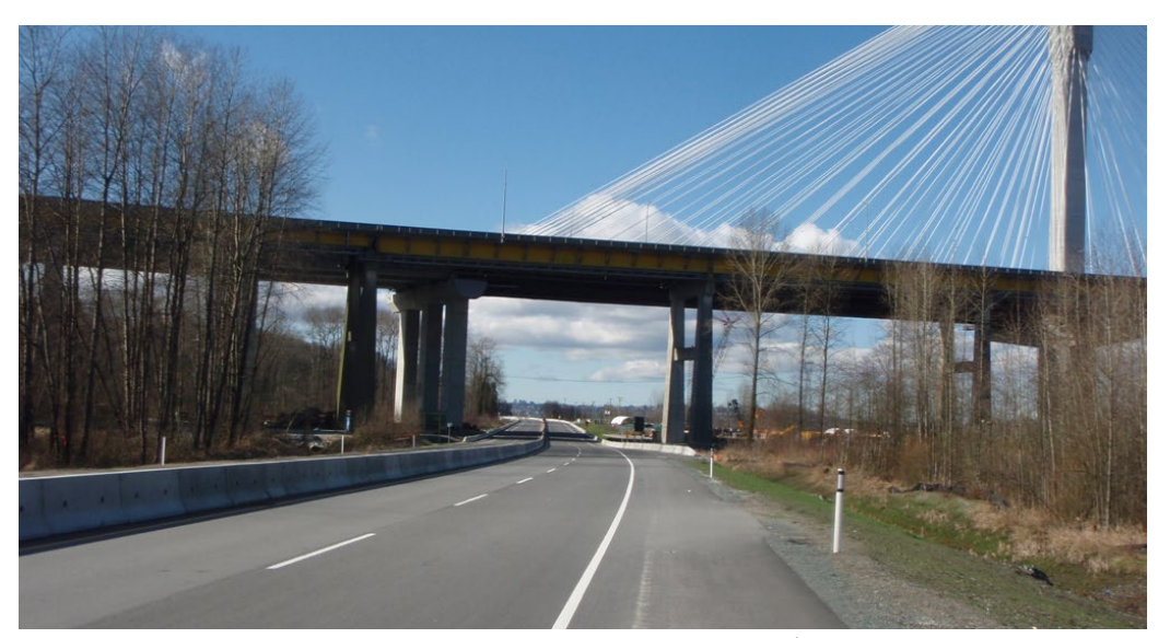
SOUTH FRASER PERIMETER ROAD AT PORT MANN BRIDGE, PHOTO ALEXANDER POPE/FLICKR CREATIVE COMMONS

In short, PBC methodology overstates the risk carried by the public sector project because it fails to consider how risk could be shed under traditional procurement. And it understates the risk associated with the P3 because it fails to address contract failure. The value of that assumed risk can be very high.